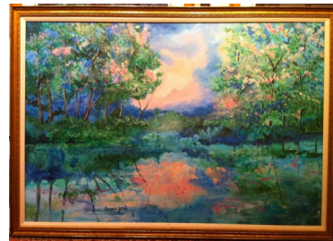
"Dreamscape" by Susan Jones. Original acrylic on canvas, Private collection.

"To create art is unbelievably difficult, to literally show a glimpse of