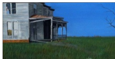
"Waiting" by Ryan Jones. Original watercolor/gouache.